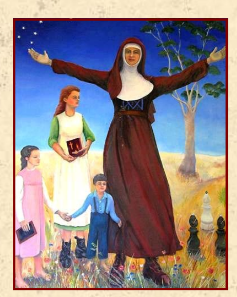
Prepared by the Sisters of St Joseph of the Sacred Heart WA, 2009