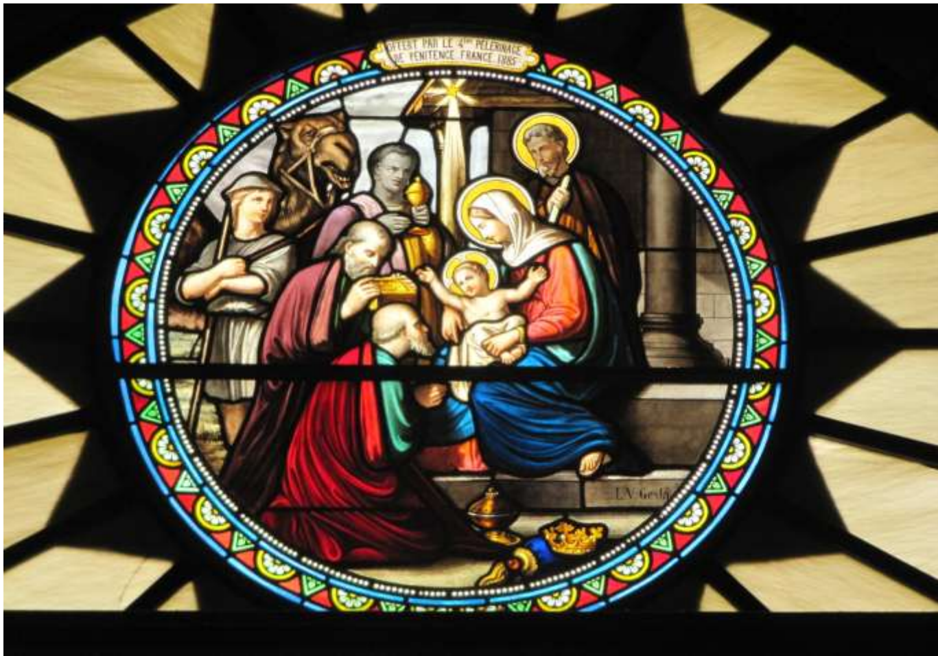
Image on ceiling of St Catherine's Chapel - Bethlehem

The shepherds returned, glorifying and praising God for all the things they had heard and seen, which were just as they had been told.