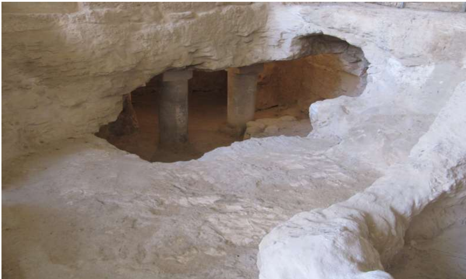
A stable was the back room of a home in a cave.

While they were there, the time came for the baby to be born and she gave birth to her firstborn, a son.