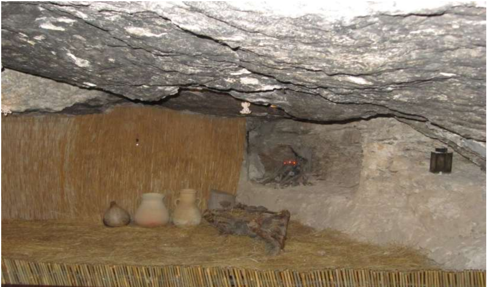
Replica model in cave at Shepherd's Fields, Bethlehem

So they hurried off and found Mary and Joseph and the baby who was lying in the manger.