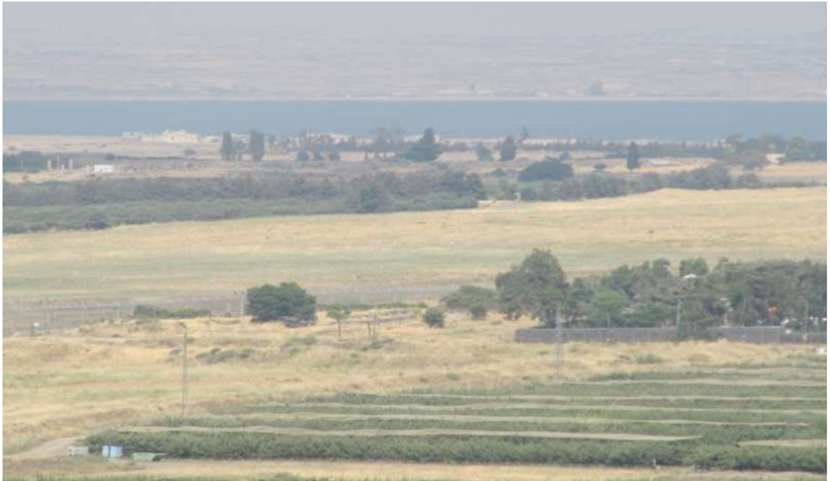
Border of Israel and Syria today

In those days Caesar Augustus issued a decree that a census should be taken of the entire Roman world. This was the first census that took place was Quirinius was governor of Syria. And everyone went to his own town to register.