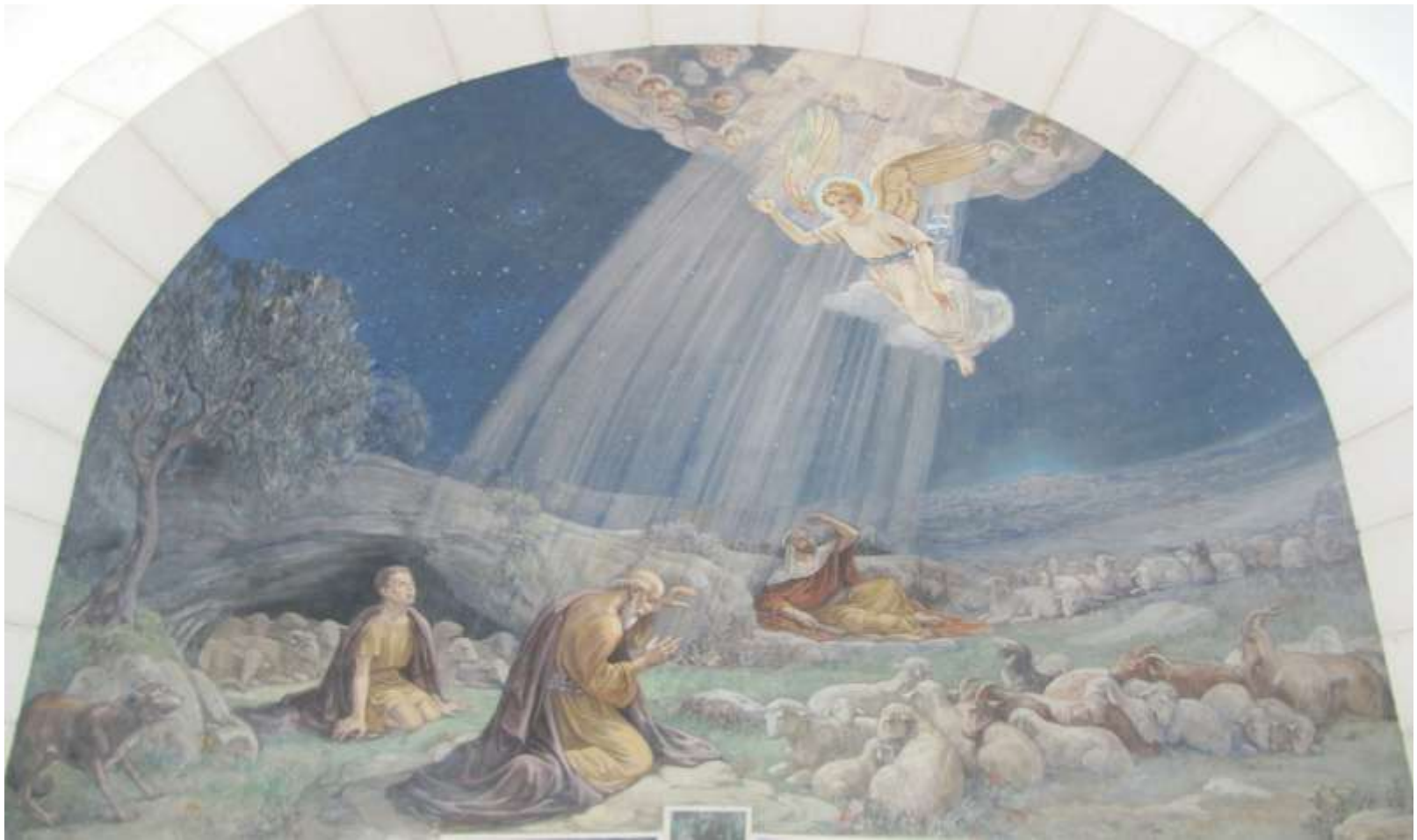
Image on ceiling of Church of the Angels, Shepherd's Fields, Bethlehem

Suddenly a great company of the heavenly host appeared with the angel, praising God and saying, “Glory to God in the highest and on earth peace to people on whom his favour rests.”