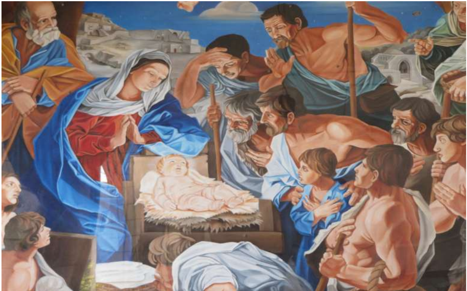
Church of the Nativity, Bethlehem, West Bank.

When they had seen him they spread the word concerning what had been told to them about this child, and all who heard it were amazed at what the shepherds said to them.