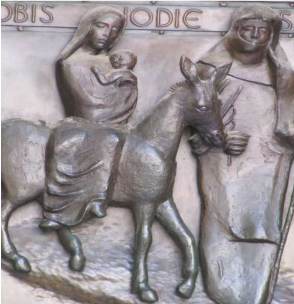
Brass plated image on door of the Church of the Annunciation, Nazareth.

He went there to register with Mary, who was pledged to be married to him and was expecting a child.