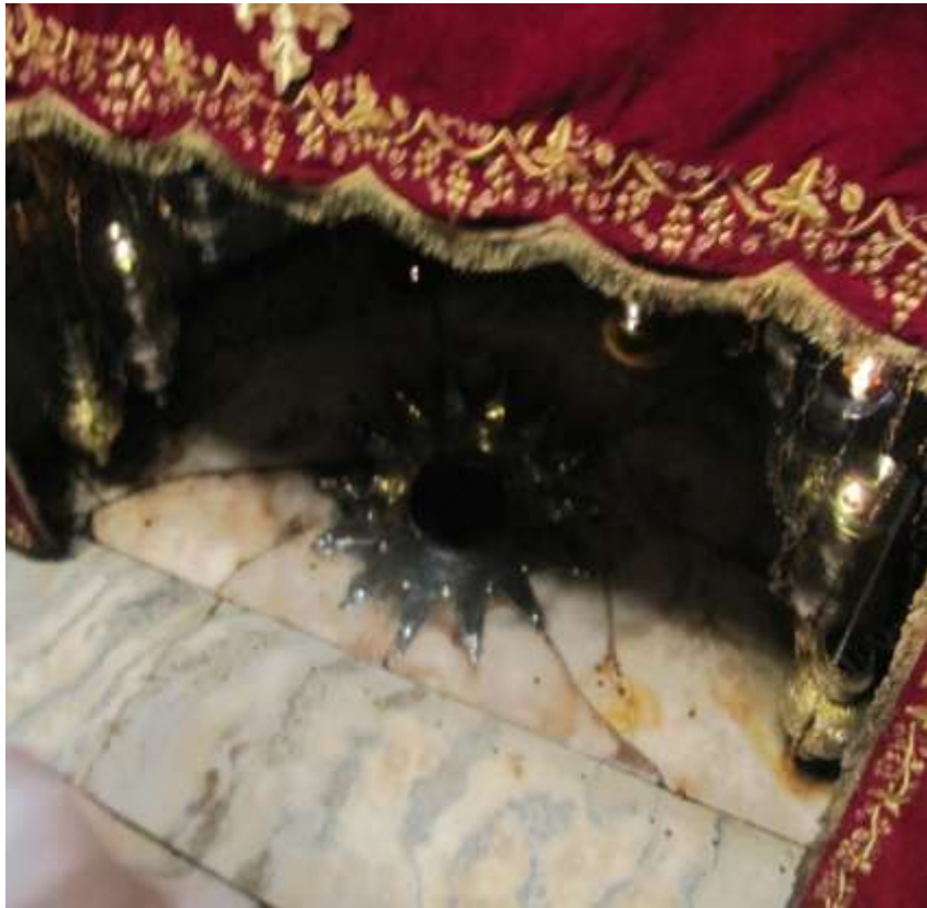
Sacred site of the Birth