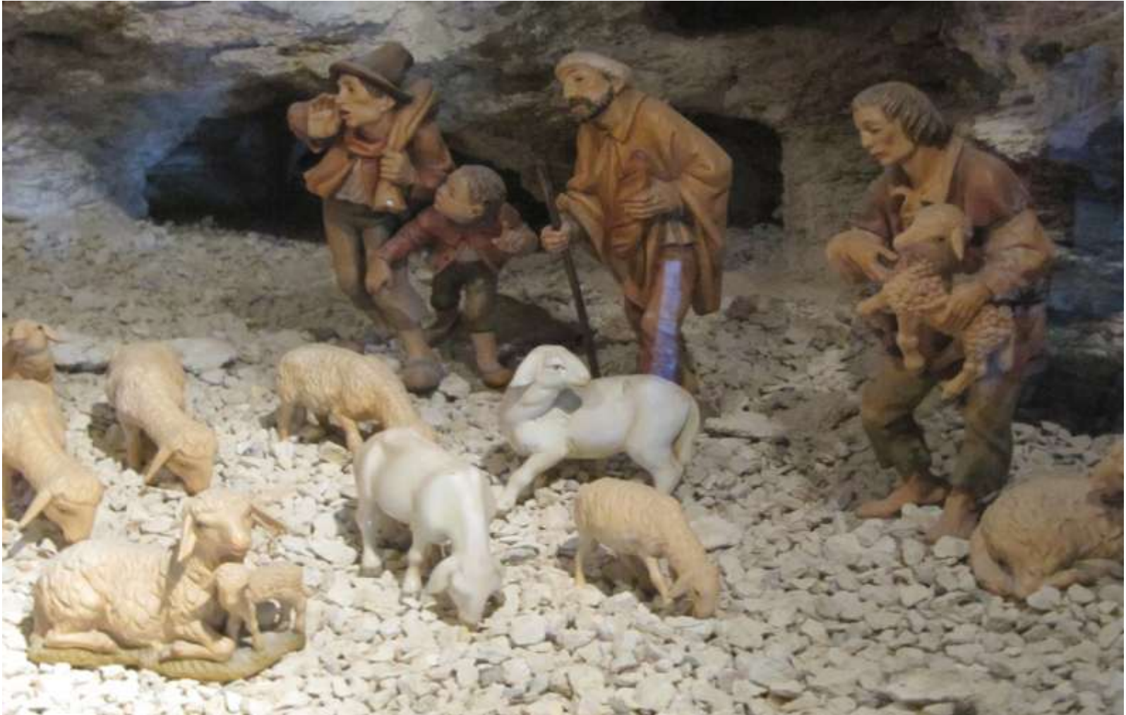
Shepherd's Fields Cave model, Bethlehem

keeping watch over their flocks at night.