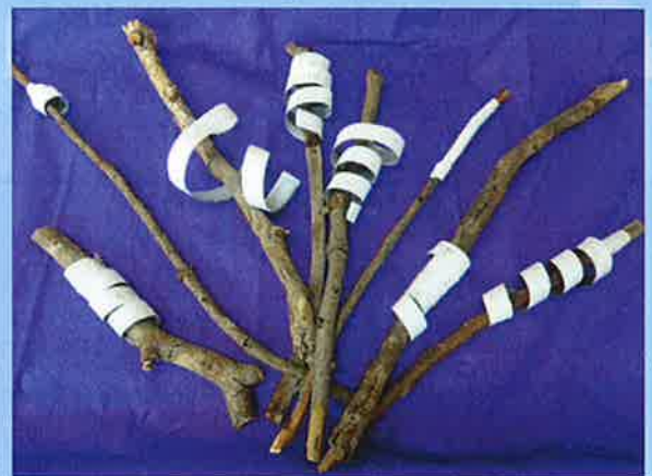
Students' prayers written in an ancient code.

We will hold an Ash Wednesday prayer to mark the beginning of Lent tomorrow at 9.30am. The students today wrote prayers of penitence. They used an ancient method of recording a message on paper coiled around a stick. When the paper is removed, the message is unreadable– except by someone with the same size stick! It was a way people used to communicate in secret. We took our prayers and burned them. Tomorrow when we receive the ashes on our foreheads, it will remind us that God made us and knows us completely, even our secrets! We should be humble before God and know that God is great.