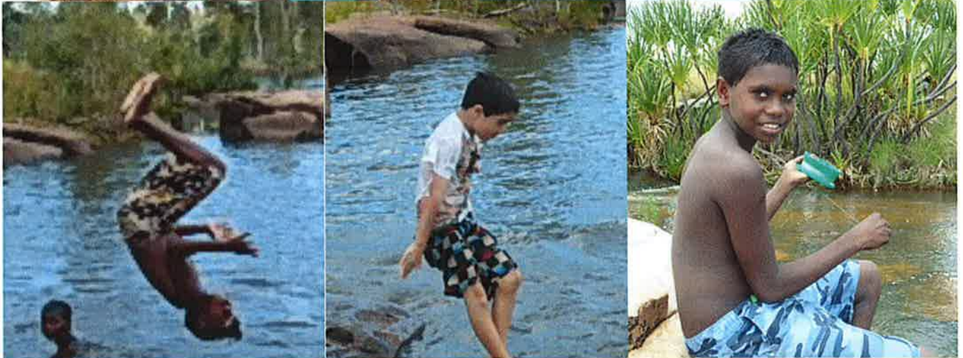
We had family members join us on our trip to Flat Rock on Friday afternoon. Some family members will be invited each week to join us on our excursion.